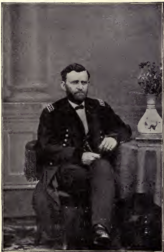
GENERAL ULYSSES S. GRANT.